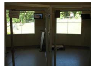
Flat-screens in every room

Thanks Dad!! Check out this place at www.wagsworthmanor.com