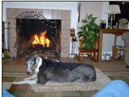
Blue relaxing by the fire