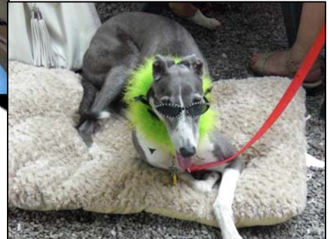
Blue all dressed up for a Saturday night dinner